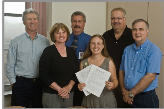
Six members of the Fifth Season Interim Board

offered invaluable guidance on budgeting, vision development, and cooperative governance.