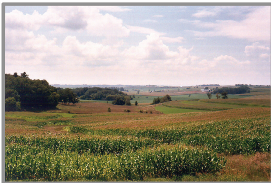
Farmland in the Driftless Region

As part of the FFI, VSN conducted an 18-month community food assessment of Vernon County to better understand the county's food assets, opportunities, and needs and to identify the best strategies for improving food security. In Vernon County, the community food assessment served as a foundation for stakeholders to identify projects, policies, and partnerships to meet the aforementioned goals of a sustainable food system. iii